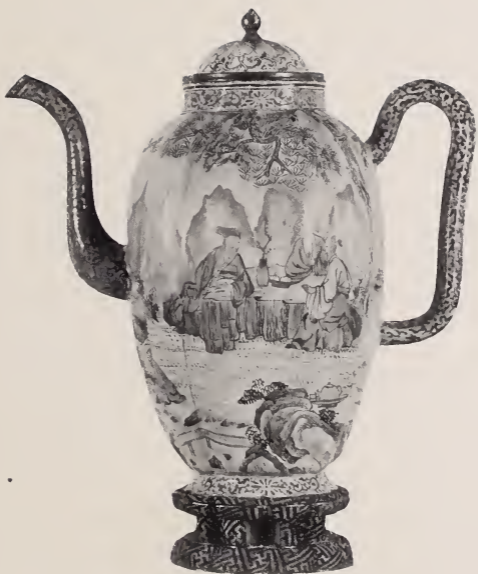
OLD ENAMELLED TEA POT